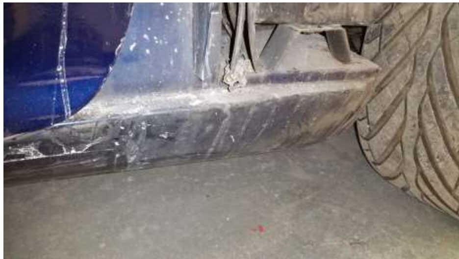
(Sill shots showing zero rust – pre Waxoyl).

The bubbling in two places around the screens turned out to be caused by previous glass replacement and not more serious rot. The bubbling was purely a surface blemish (Note – I was present for glass refit and great care was taken to ensure no repeat).